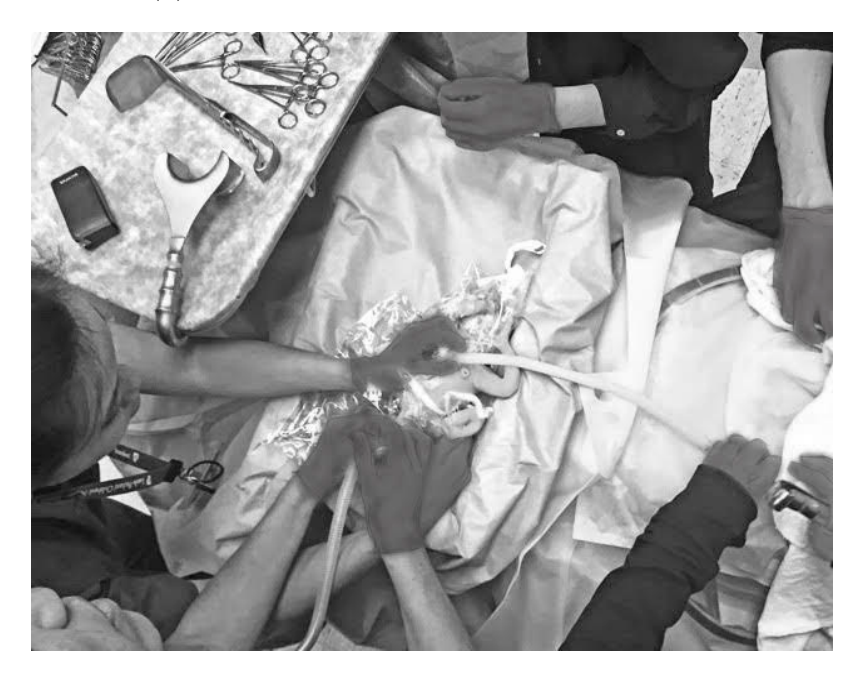
Figure 2. Simulation of delayed cord clamping with a premature manikin. In this image, a member of the neonatal team is assessing the infant's heart rate, while another neonatal provider is providing ventilation with a facemask and t-piece resuscitator.